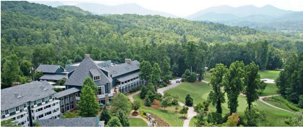
Brasstown Valley Resort

JOIN TCTECH NOW AND ENJOY THE BENEFITS OF A GREAT PROFESSIONAL ASSOCIATION!